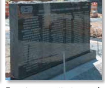
The granite monument lists the names of steelworkers that have lost their lives at the Coatesville operation.