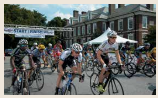
Contestants start one of the Amateur races of the Third Annual